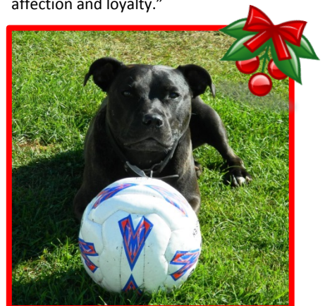
Ziggy with his 'tell-tale' half inflated football.