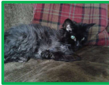
Milly was found wandering alone, thin and very frail. For the past 2 ½ years she has been living happily with a lady in Yateley, receiving love and comfort from her owner and regular medication and tests with our support.

However, this Branch recognises that some adopters may be concerned about potential veterinary costs that ownership of a mature pet could involve, especially if these costs are on-going. In order to assist owners with these older companions we are pleased to offer our Senior Years Vet Support Scheme . This scheme (given at our discretion) allows an owner to claim certain veterinary treatments for age related illness which the rehomed cat might be suffering from or may develop in future years.