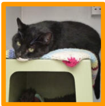
11 yr old Boots recently very happily rehomed following the death of his owner.

AND HOW WE HELP..... As with most rescue Centres and RSPCA Branches we take in our fair share of older cats. Often these cats, in their middle or twilight years, come to us because an owner has passed away or needs to move into care and it is a sad situation for all. Occasionally a cat will be out on the street in a distressed and vulnerable condition. We always do our best to place the often disorientated and stressed cat into foster care, rather than our cattery pens in order to replicate the cosy warmth and companionship of the home they may have been used to.