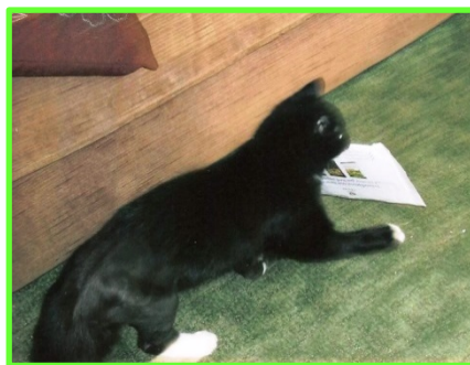
Mono on one of his daily trips to collect the post from the doormat!