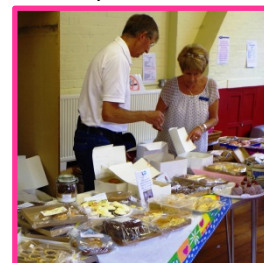
Cakes Galore, baked by our volunteers

Our "Paws-A-While" Café did very well selling refreshments, freshly made rolls & homemade cakes to eat there or takeaway.