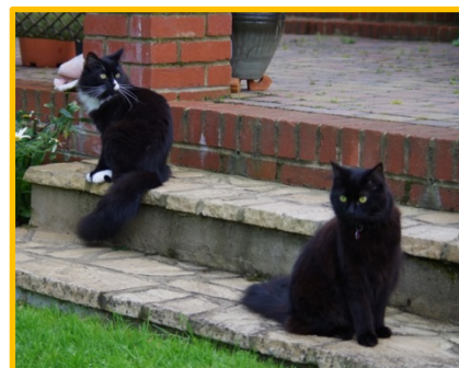
Sylvester (left) and Izzy (right) enjoying time together in the garden sunshine

Very happily we soon found Mono a new forever family where he has made himself completely at home. There are children to play with, a glorious garden to explore and better still, we were able to match him with a young female cat companion called Izzy who we rehomed to the family shortly afterwards. Mono, or Sylvester, as he has been renamed, follows Izzy everywhere and they are the best of friends.